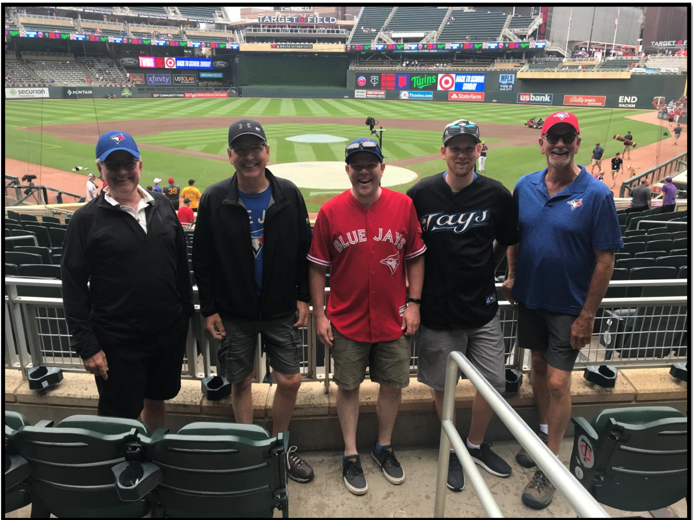
Band of Brothers Baseball, 2022