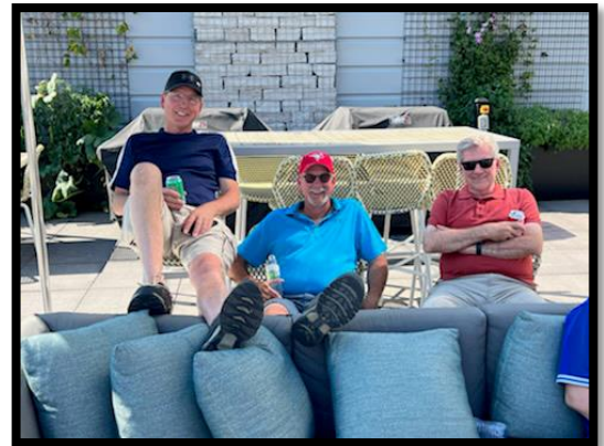
Band of Brothers at the pre-game warm-up.